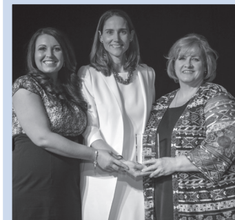
Letcher Manor Nursing and Rehabilitation Facility, Whitesburg