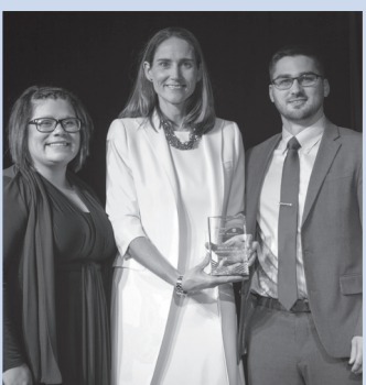
Oakmont Manor, Flatwoods