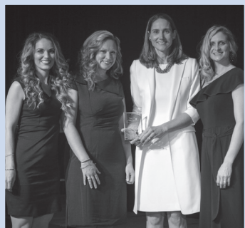
Diversicare of Greenville, Greenville

2018 THE BEST of KENTUCKY NURSING & REHABILITATION