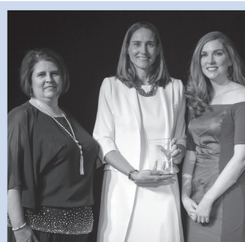
Williamsburg Health and Rehabilitation Center, Williamsburg