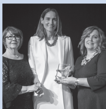
Wolfe County Health and Rehabilitation Center, Campton