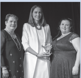
Knott County Health and Rehabilitation Center, Hindman