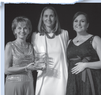
Hillside Center, Madisonville