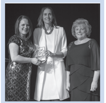
Corbin Health and Rehabilitation Center, Corbin