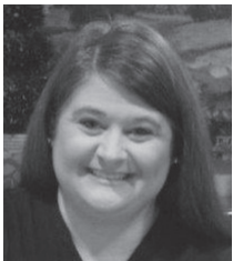
Cynthia Hamilton Presidential Scholarship, Barbourville Health and Rehabilitation Center, Barbourville