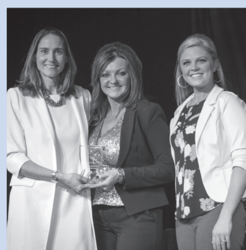
The Terrace Nursing and Rehabilitation Facility, Berea