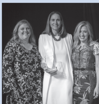
Nazareth Home Clifton, Louisville