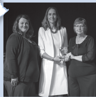
Boyd Nursing and Rehabilitation Center, Ashland