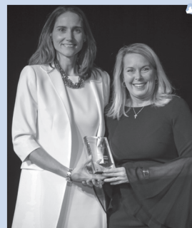
Highlandspring of Fort Thomas, Fort Thomas