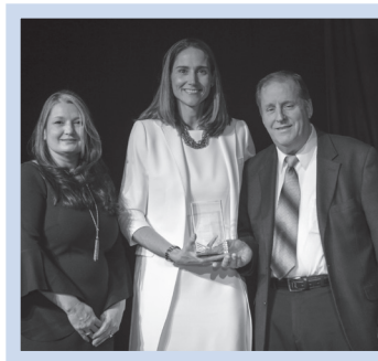
Crestview Center, Shelbyville