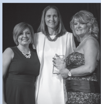
Masonic Communities of Shelbyville, Shelbyville