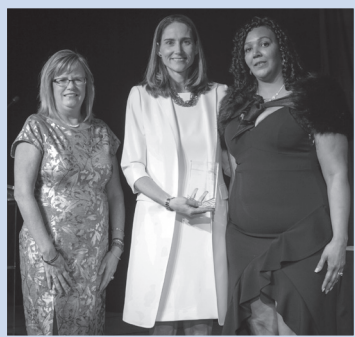
Rivers Edge Nursing and Rehabilitation Center, Prospect