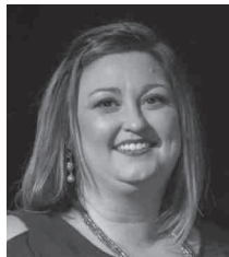
Angela Smallwood Ridgeway Nursing and Rehabilitation Facility, Owingsville