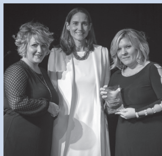
Grand Haven Nursing and Rehabilitation Center, Cynthiana