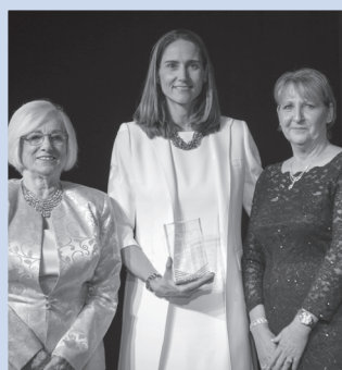
Morganfield Nursing and Rehabilitation, Morganfield