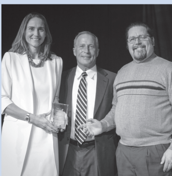
Salem Springlake Health and Rehabilitation Center, Salem