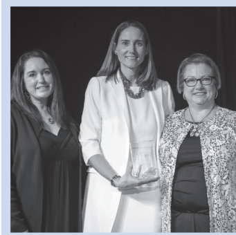
Nazareth Home, Louisville