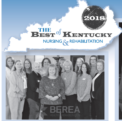
Berea Health and Rehabilitation Facility, Berea