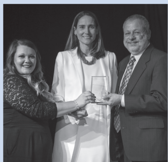
Kenwood Health and Rehabilitation Center, Richmond