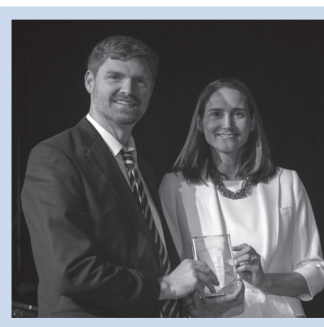
Dawson Springs Health and Rehabilitation Center, Dawson Springs