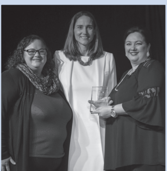
Maysville Nursing and Rehabilitation Facility, Maysville