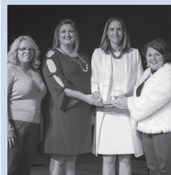
Ridgeway Nursing and Rehabilitation Facility, Owingsville