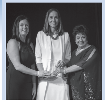
Brandenburg Nursing and Rehabilitation Center, Brandenburg