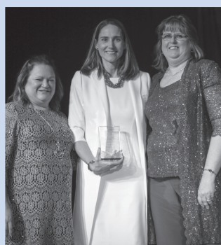
Redbanks Skilled Nursing Facility, Henderson