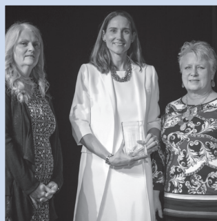
Landmark of Laurel Creek, Manchester