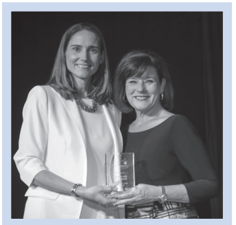
Former Diversicare of Glasgow, now Barren County Nursing and Rehab, Glasgow