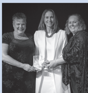
Villaspring of Erlanger, Erlanger