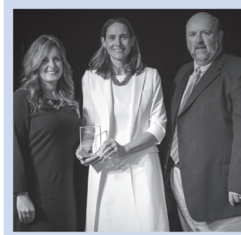
Carter Nursing and Rehabilitation Center, Grayson