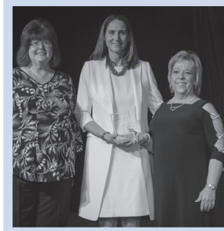
Concordia Nursing and Rehabilitation Center, Greenville