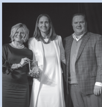
Superior Care Home Nursing and Rehabilitation, Paducah