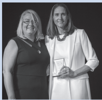
Rosedale Green, Covington